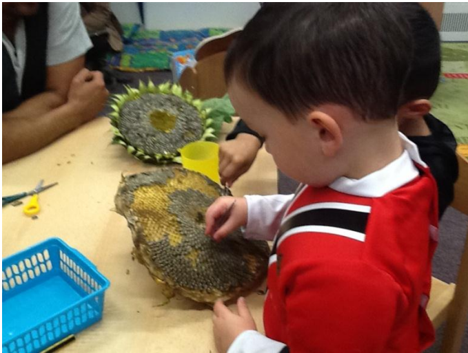
Collecting sunflower seeds in EYFS and searching for food groups in ASDA

Learning across the rest of the curriculum went well last half term too. In EYFS we had a great Halloween Stay and Play, with mams, dads and grandparents all coming along for the sessions. In KS1 the children went to Asda to find out about different foods and mapped their journey there.